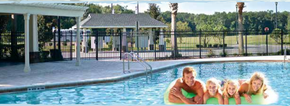
Pool & Clubhouse