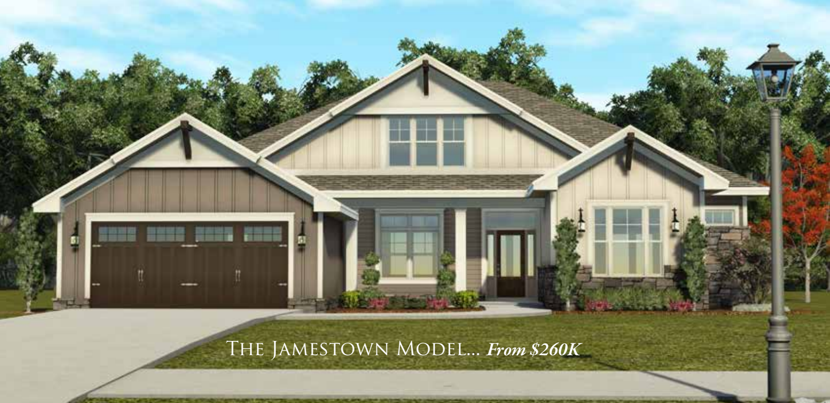
THE JAMESTOWN MODEL... From $260K

5 EXCITING HOME PLANS TO CHOOSE FROM, STARTING IN THE LOW $200's.