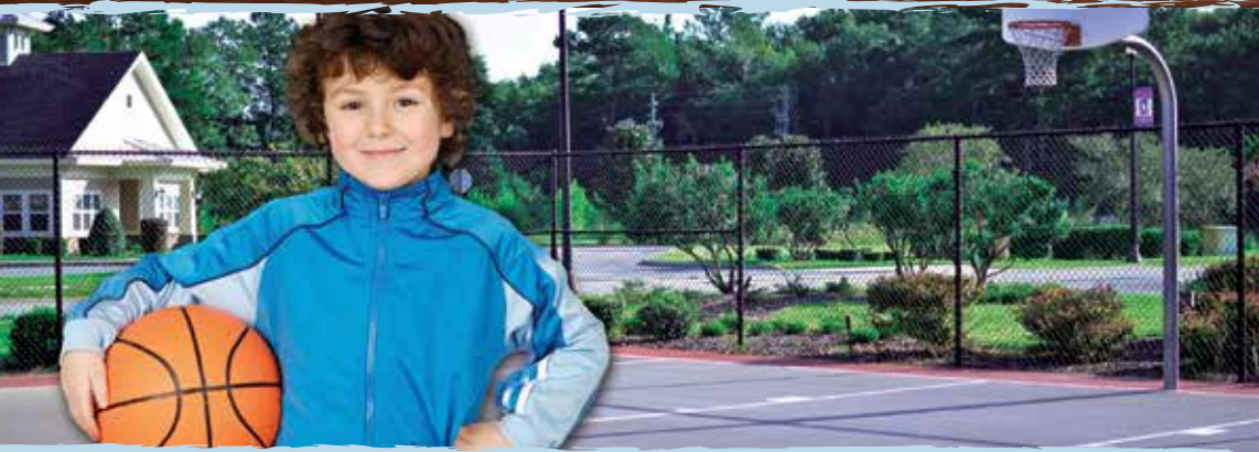
Basketball & Tennis